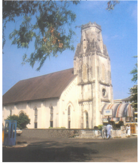
Plate 4.1.1.Exterior view showing the Gothic window and the tower

Before the completion of this building self-determination began to arise among the leadership of the Church which led to reverting from their adopted English names to the traditional names because Christianity was being closely linked to cultural imperialism of the Western world. After the dedication of the church building, there arose another dispute which led to a breakaway. The breakaway group pulled out of the church without referring the matter to the home Mission in America and held its first service under a temporary shed in a yard along Wesley Street, Lagos. Before the end of that week, a bamboo shed was put up in that yard and it became their place of worship for many years before another site was acquired for the construction of their own building.