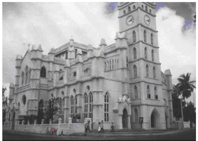
Plate 4.2.1. Exterior view of the church when it dominated its environment

later expanded to accommodate more. The construction was in three phases and lasted for 21 years with the first phase commencing on 21 April 1925 and the final phase being completed on 1<sup>st</sup> May 1946.