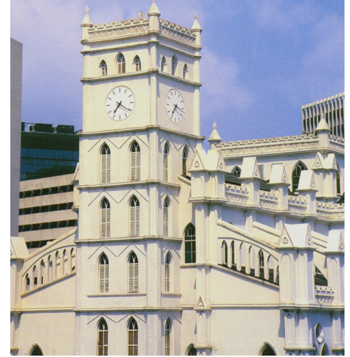
Plate 4.2.2 Entrance Porch