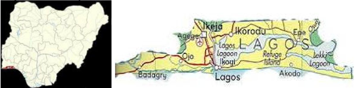
Plate 2.1 Map of Nigeria showing Lagos at left bottom side

Lagos State is identified as the custodian of the highest number of the Church buildings built during the period under study. The nature of Lagos, being one of the metropolitan mega cities, gives an impetus to the flourishing of the spread of religious activities because Christianity development has become an urban phenomenon (Anderson, 2003). Lagos' cosmopolitan structure accommodates the influence of every Nigerian tribe (Census 2006). It was also the first capital of the Federal Republic of Nigeria. Lagos State is located in the southwest part of Nigeria with a population of 9,019,534 (2006 census) and an area of 3,577 square kilometres including twenty two per cent (22%) of lagoons and creeks.