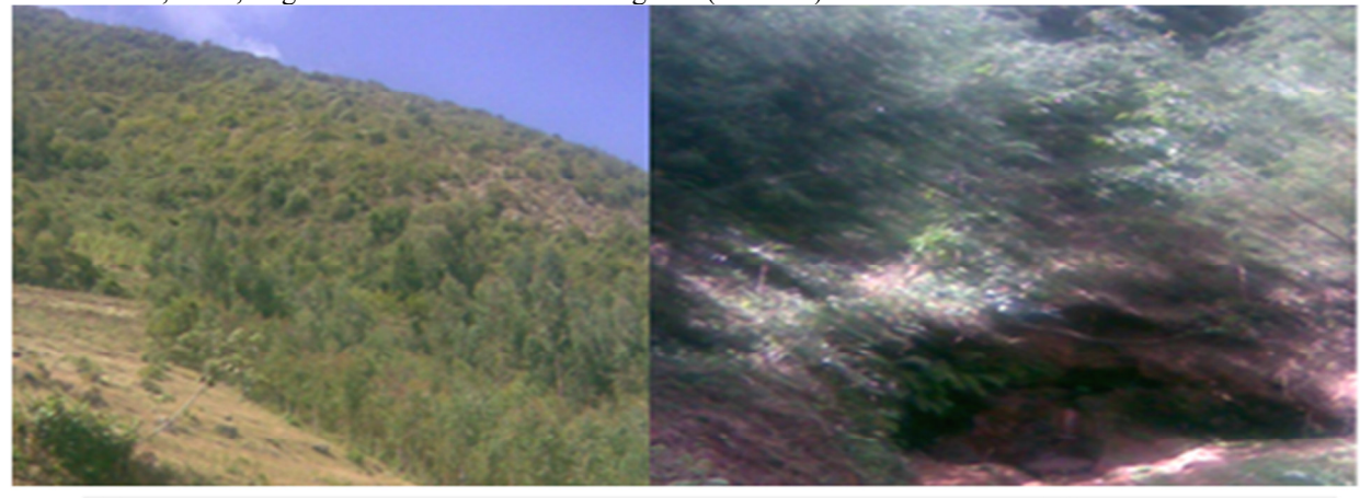
A) Figure3: Rehabilitated degraded forest land (A) and one of the springs emerged after the rehabilitation (B) near Mount Damota carbon sequestration forest site.

Environmentally, in the household survey conducted around carbon forestry project of Mount Damota in Southern Ethiopia, about 76.03% respondents indicated as the conditions of their environment are getting improved after the implementation of the project(Belete, 2014). Regarding the perceived environmental improvements, the key informants also mentioned some wild animals those started to enter to the rehabilitated forest area like Hyna, Moneky, Ape, Rabbit, Fox, Tiger and different species of Birds. They also added about the improvements of the rehabilitation on availability of water by naming some of the springs that emerged from rehabilitated forest which included Diguna, Weselemo, Balgubasa, Atekusa, Mengesha mena, Mena gedebo, Kuman dabo, Ekua, Tega and Danche as shown in Figure3 (A and B).