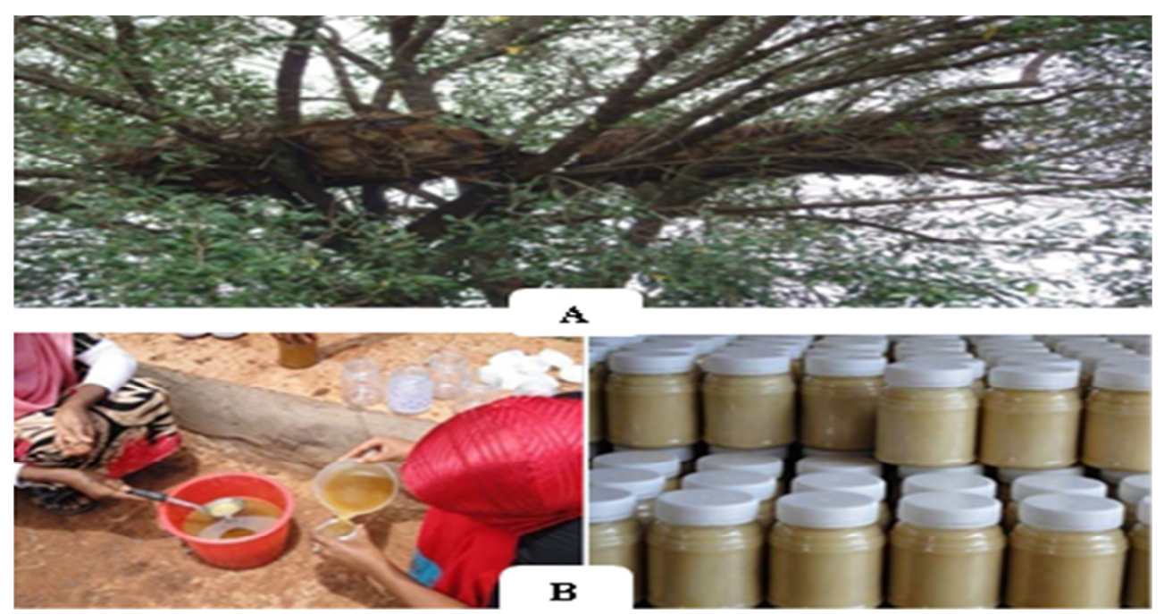
Figure1: Traditional bee keeping (A) and honey processing and packing (B) for income generation in Dalo Mena Bale –Ecoregion, Source: Mengstu (2013)

The study evidence at Dendi Destrict, in Ethiopia showed that participatory forest management enhanced the non-cash oriented livelihood through for example forest wood for cooking and construction purposes and fodder for livestock (Tadesse and Alemtsihay, 2012). The PFM which is being mainly in the three sites (Chilimo, Bonga and Bale Eco-region). These values can be classified into two categories, or value systems, which we call hard and soft value systems. Hard value systems refer to tangible, actual product values and realizable incomes, such as timber which contribute to their livelihood as shown table (Temesgen et al., 2007).