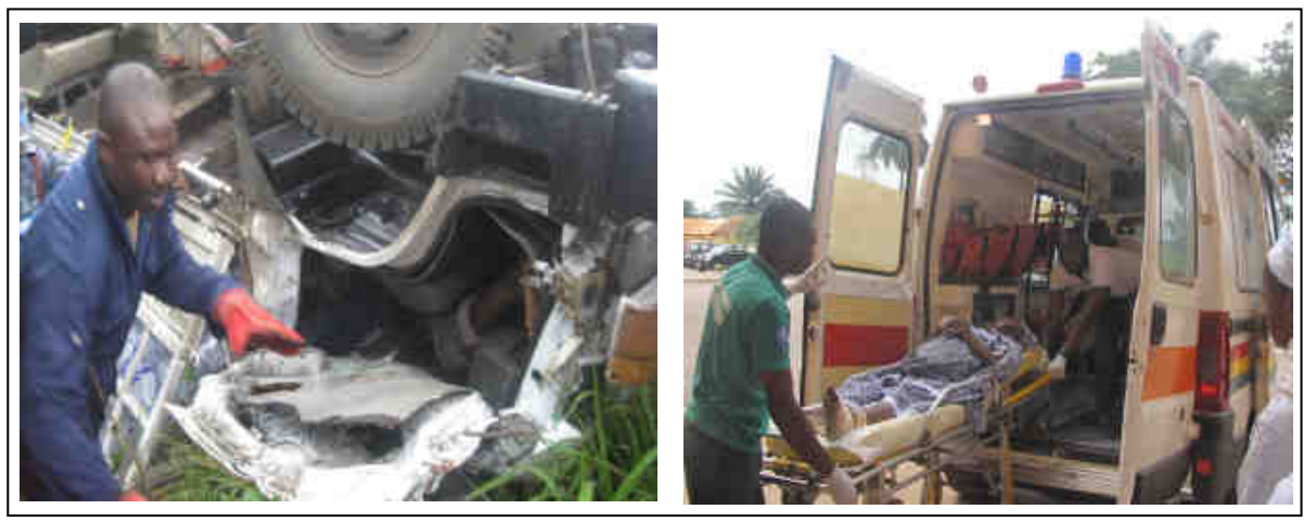
Figure 2: NAS staff attending to a patient at an accident scene

Moreover, the study established that despite the challenges faced by NAS and KATH in the provision of quality EMS especially in times of motor accidents, pragmatic efforts were made to improve health conditions of patients on arrival at accident scenes and during transit by NAS staff and at the referral centre by KATH staff. Picture coverage of an instance of a motor accident during the study period was included in this study to exhibit roles played by both staff of NAS and KATH during such emergency situations (Figure 2 and Figure 3). However, there were other cases presented to KATH by both private ambulance services and NAS during the study period. These included 40% trauma cases, 35% medical conditions, 15% burns cases, and 5% each on urological and neurological cases. This was evident when 76.2% of the referral staff claimed that they often rely on the services of other ambulance services in the provision of EMS.