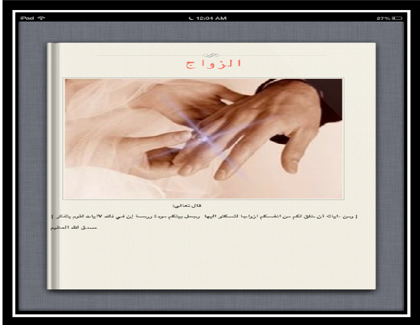
Figure (2): The title of the lesson, which contains the gracious Ayah that confirms the legality of marriage (Ayah 21 from Sour at Al- Room)