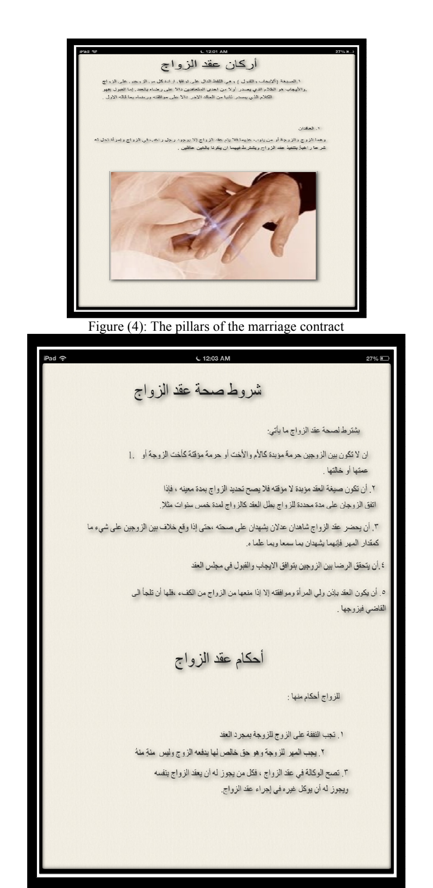
Figure (5): Conditions of the validity of the marriage contract and its provision