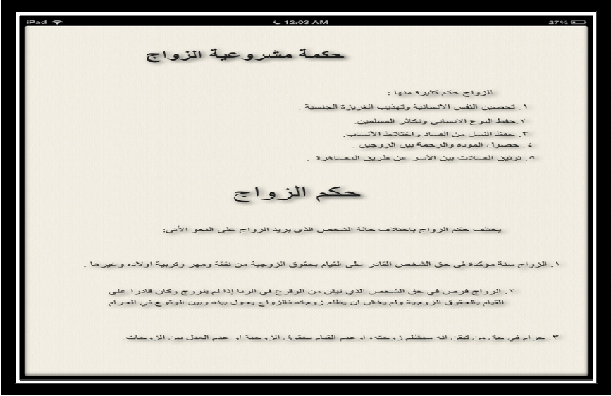
Figure (3): Wisdom of the legality of marriage and its legal judgment