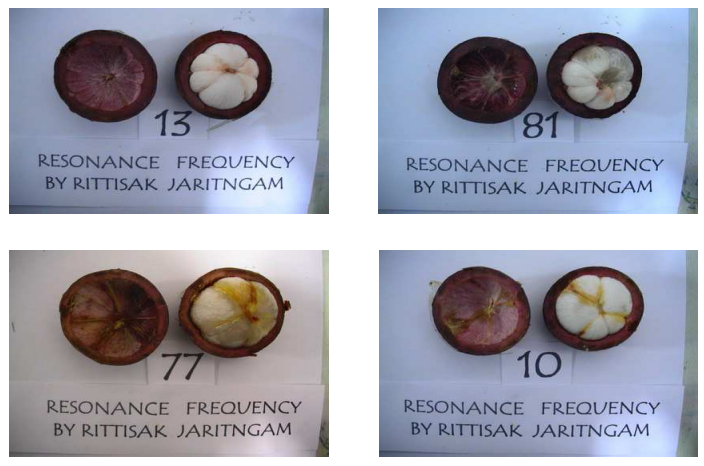
Fig 2 (a) good sample (b) translucent sample (c) translucent fruit and yellow gummy latex (d) yellow gummy latex