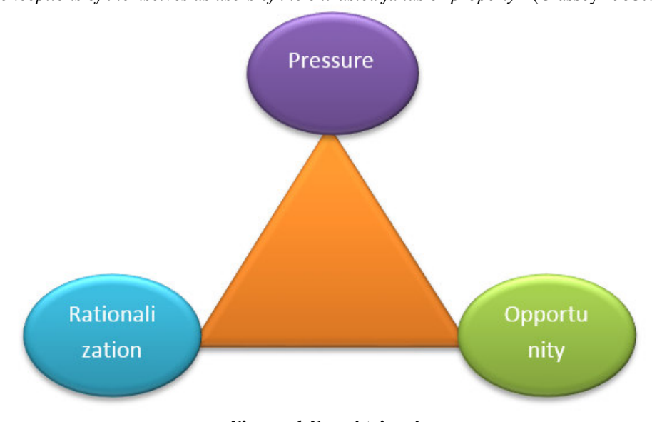
Figure: 1 Fraud triangle

"Trust violators, when they conceive of themselves as having a financial problem which is non-shareable, and have knowledge or awareness that this problem can be secretly resolved by violation of the position of financial trust. Also they are able to apply to their own conduct in that situation verbalizations which enable them to adjust their conceptions of themselves as trusted persons with their conceptions of themselves as users of the entrusted funds or property" (Crassey 1953:742).