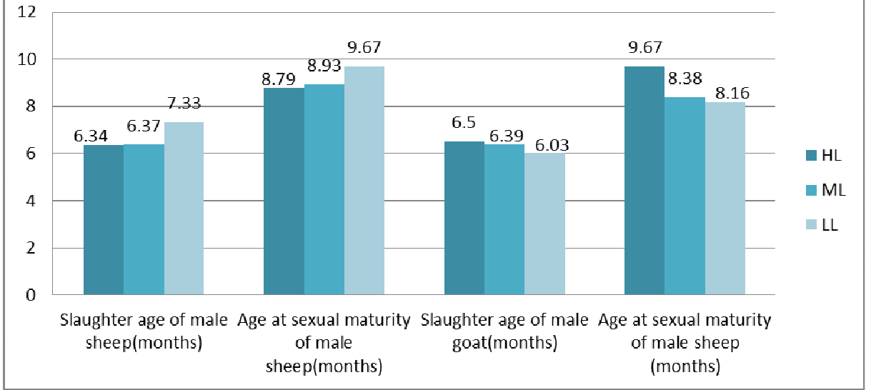
Figure 1: Comparison of Slaughter age and ASMM of male sheep and goat in three AEZs