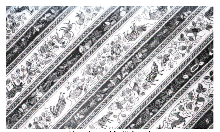
Alas-alasan Motif form Lasem (Manex N. V. – Oldenzaal, 1955)

Placement of the motif elements is random; direction toward each element also looks free. There is no particular pattern to the direction toward each element of motif. However, the crown-shaped ornaments at four corners of the cloth completely overlooks into the center. In addition to the palace batik, Alas-alasan motif can also be found in ordinary society. At Lasem batik, decorative motif elements, both animals and plants figures, are illustrated with living stylization. Compositional structure of the motif elements is arranged in a diagonal pattern in four rows. Two rows illustrate the main theme (subject-matter) and two columns describe the decorative edge.