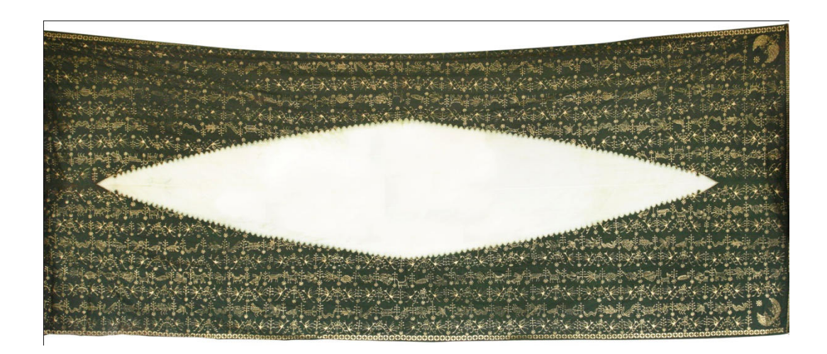
Alas-alasan Motif form Surakarta Palace (Photography: Agus Heru Setyawan, 2009)

Alas representation on the Alas-alasan motif of Surakarta royal palace impresses a spontaneity and simplicity. Line as the main visual element in the depiction of motifs is expressed through a spontaneous single line. Single lines are characteristic of the portrayal of the motif. Likewise, additional elements to beautify motif commonly called stuffing (isèn) in the form of cecek, sawut or the like, are commonly found in the traditional batik, nil of the depiction. Isèn is applied to accentuate the element motif, especially for animal figures. Isèn applied to the head, body, and tail of the animal appears streaked with a very simple way.