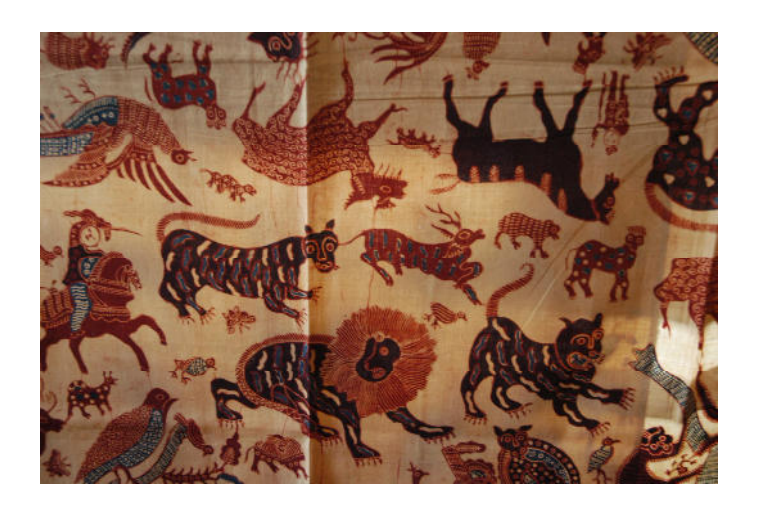
Alas-alasan Motif from Banyumas

Important ideas about the gunung can also be found in traditional Javanese batik, both of which thrive in the ordinary society as well as in the palace. Gunung conception expressed in batik motif is seen through the Alasalasan and Semèn motif. Motifs depicting sacred gunung -shaped element is represented in the forms of birds and animals, trees, holy places and pond ( blumbangan ) (Maxwell, 1990).