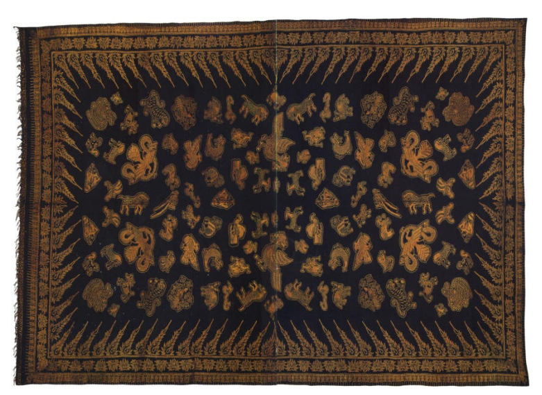
Alas-alasan Motif from Yogyakarta Palace (Doellah: 2002)

Stylization is a technique used to describe all elements of the animal-shaped motif. In particular, each element of the animal figures is depicted by enclosed by the outer line following the structure in it. Strong stylization techniques seem over the depiction of decorative elements that form the edge of the flames. Composition of animal-shaped elements is symmetrically arranged either horizontally or vertically. Horizontal symmetry divides the same plane between the right and left into halves. Vertical symmetry divides the same plane between the upper and lower sides into halves.