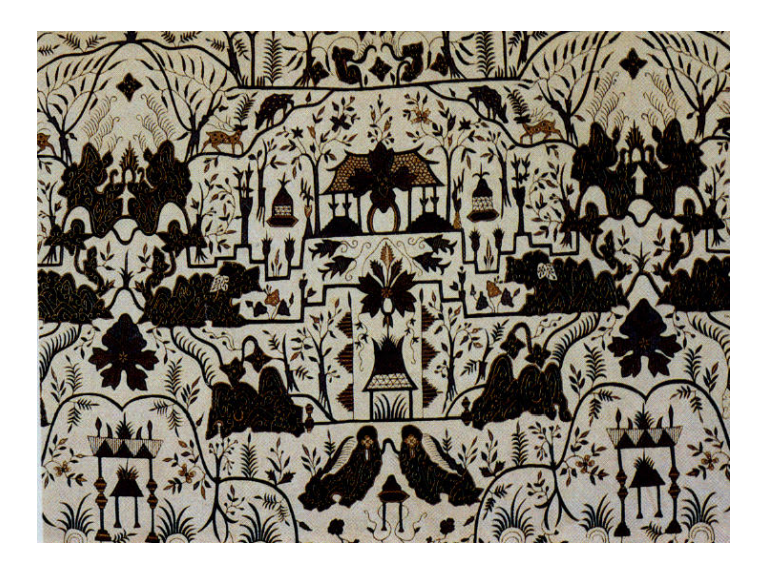
Taman Arum Sunyaragi Motif (Djoemena, 1986)

Depiction of gunung and Mahameru in batik motif can be seen such as Taman Arum Sunyaragi traditional batik of Cirebon, West Java (van der Hoop, 1949). Semèn motifs composed of walls of the tomb Sendangduwur, Paciran, Lamongan, is a representation of the gunung . Aesthetic elements of the old walls of the mosque complex in the tomb of Queen Kalinyamat Mantingan, Jepara can also be regarded as a representation of the gunung .