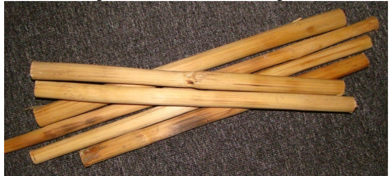
Figure 3. Rattan after sulfur Fumigation